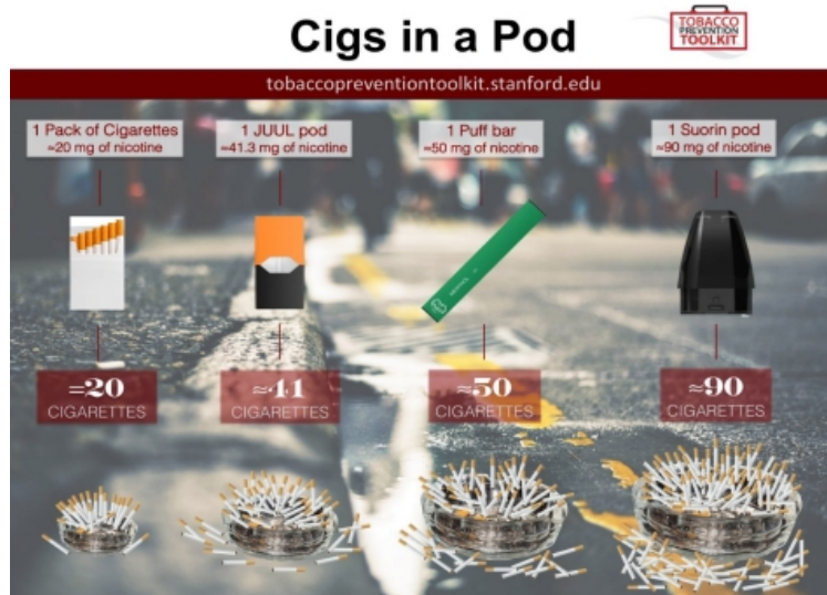
Fig. 1) Sample campaign poster taken from the Stanford Tobacco Prevention Toolkit

School-wide messaging campaigns may include school-wide distribution of age-appropriate posters and flyers that emphasize fact-based information. Messaging tactics will avoid shaming or fear-based approaches. School personnel and community partners may host school-based events, such as tables or assemblies, to share prevention-focused information with students.